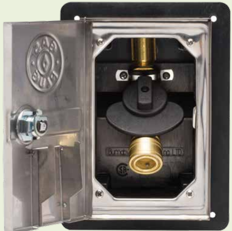
Convenience outlets offer flexibility for portable outdoor gas appliances, allowing a homeowner to plug into the home's natural gas supply in the same way electrical appliances plug into an electrical outlet.