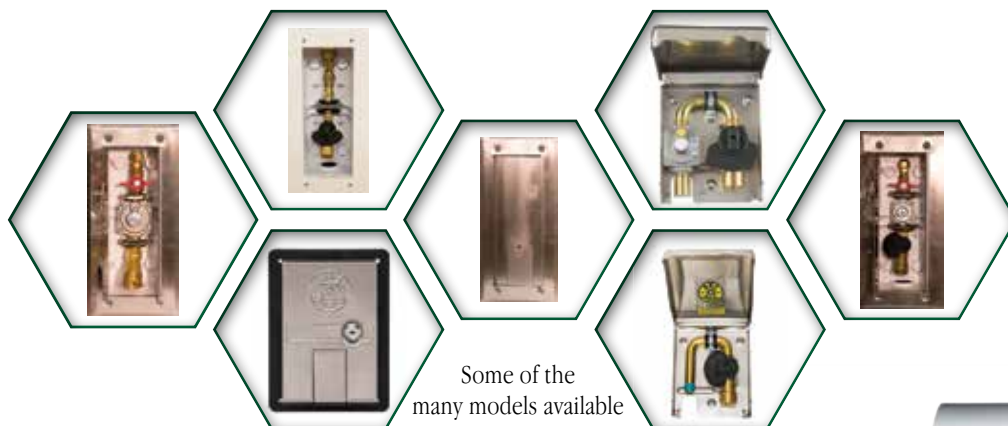
Some of the many models available